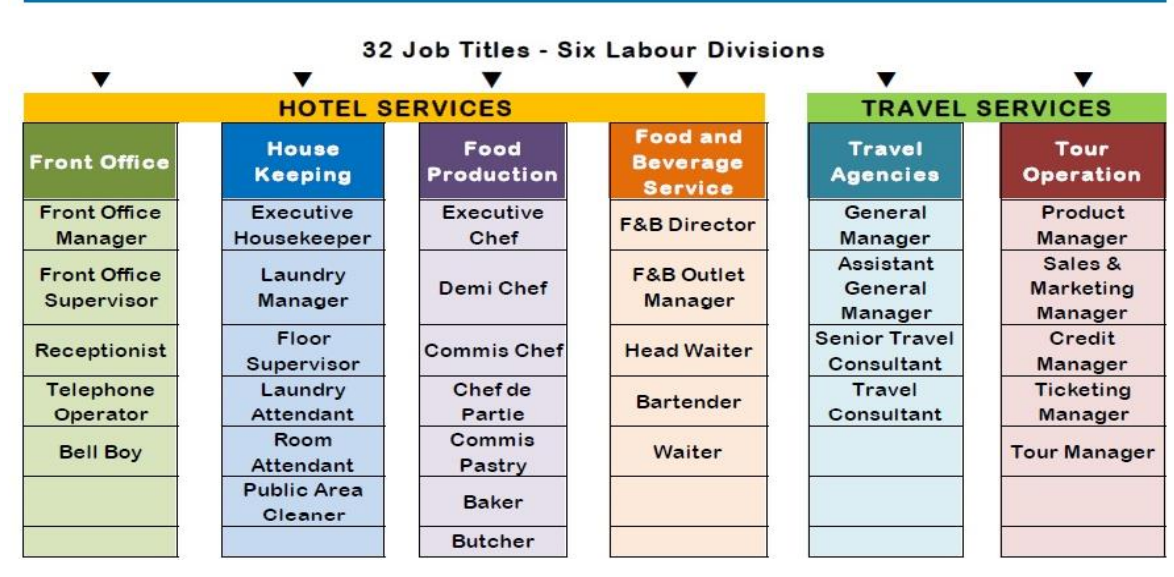
Figure 3. Six (6) Labor Divisions and Thirty (32) Job Titles